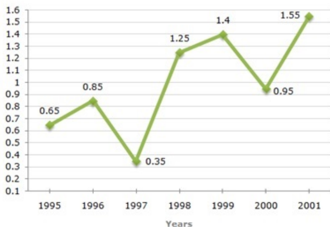
Ratio of Value of Imports to Exports by a Company Over the Years.

In which year, the imports were minimum proportionate to the exports of the company?